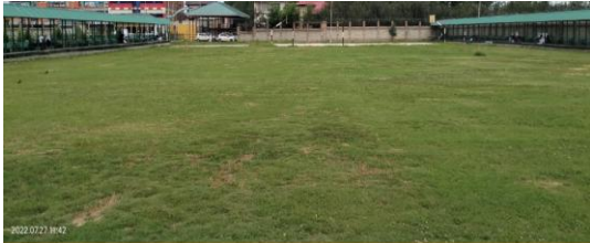
COLLEGE PLAY FIELD