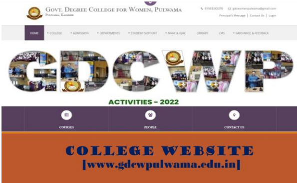
COLLEGE WEBSITE [www.gdewpulwama.edu.in]