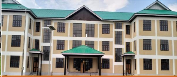
OUR NEW SCIENCE BLOCK