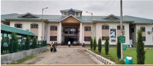
CAMPUS AT A GLANCE