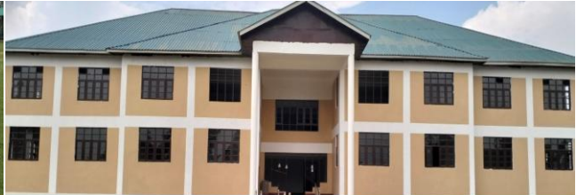
OUR NEW LIBRARY BLOCK